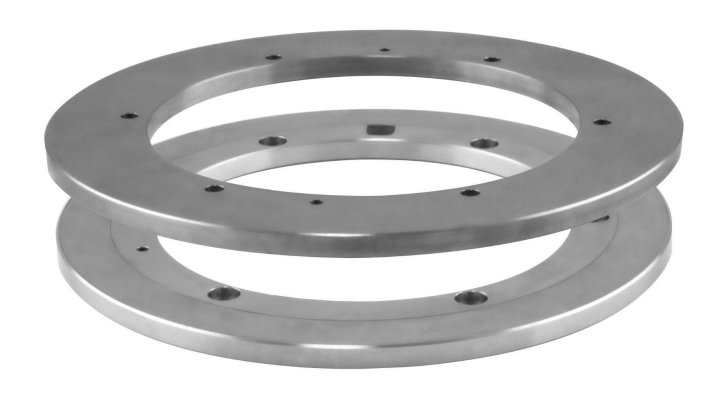
*GMI-ANGLE-160 (size 160mm)

More details on this, dimensions and tolerances are shown in the dedicated technical data sheet attached to this document or on the website <a href="https://www.flux.gmbh">www.flux.gmbh</a>.